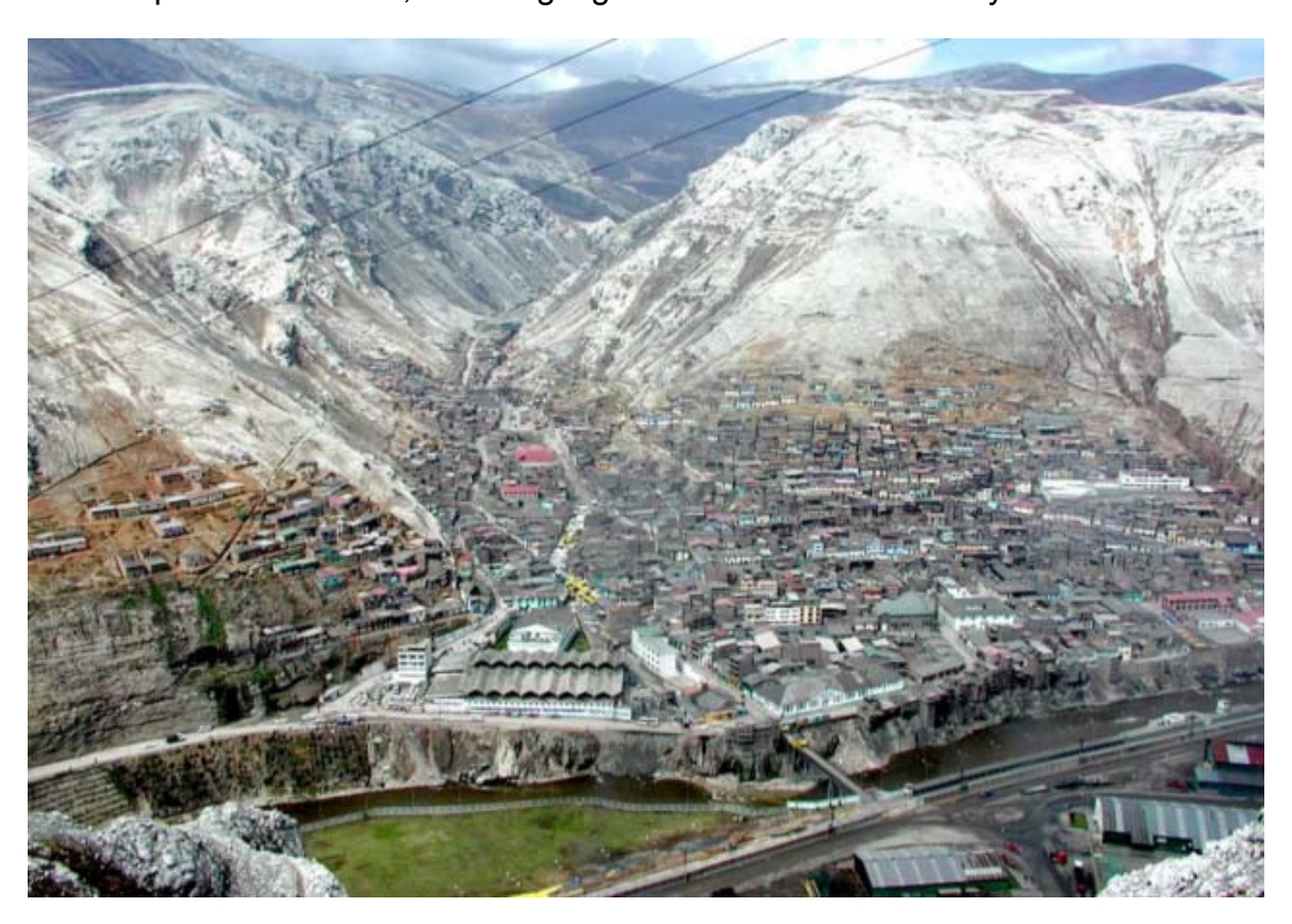
La Oroya Antigua

Added to the problems caused by the geography and the proximity to the plant, the community of La Oroya Antigua is a poor neighborhood. Many of the houses were originally built to "squatter" standards, that is, no building regulations, cement blocks, mud plaster and dirt floors, and no sanitation or potable water. In 1997 many of the roads in the area were just dirt contaminated with 75 years of the complex's emissions, including high levels of lead and heavy metals.