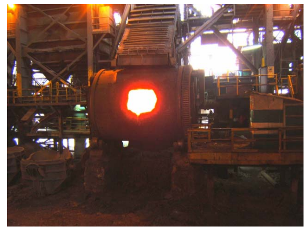
A copper converter

At first, the installation of a Copper IsaSmelt could be considered to be a process improvement to strengthen line, bottom but commissioned in October 2009, the single IsaSmelt furnace will reduce the number of Copper Converters from four to one and eliminate four out of the six operating copper roasters, thereby significantly reducing the risk of fugitive emissions.